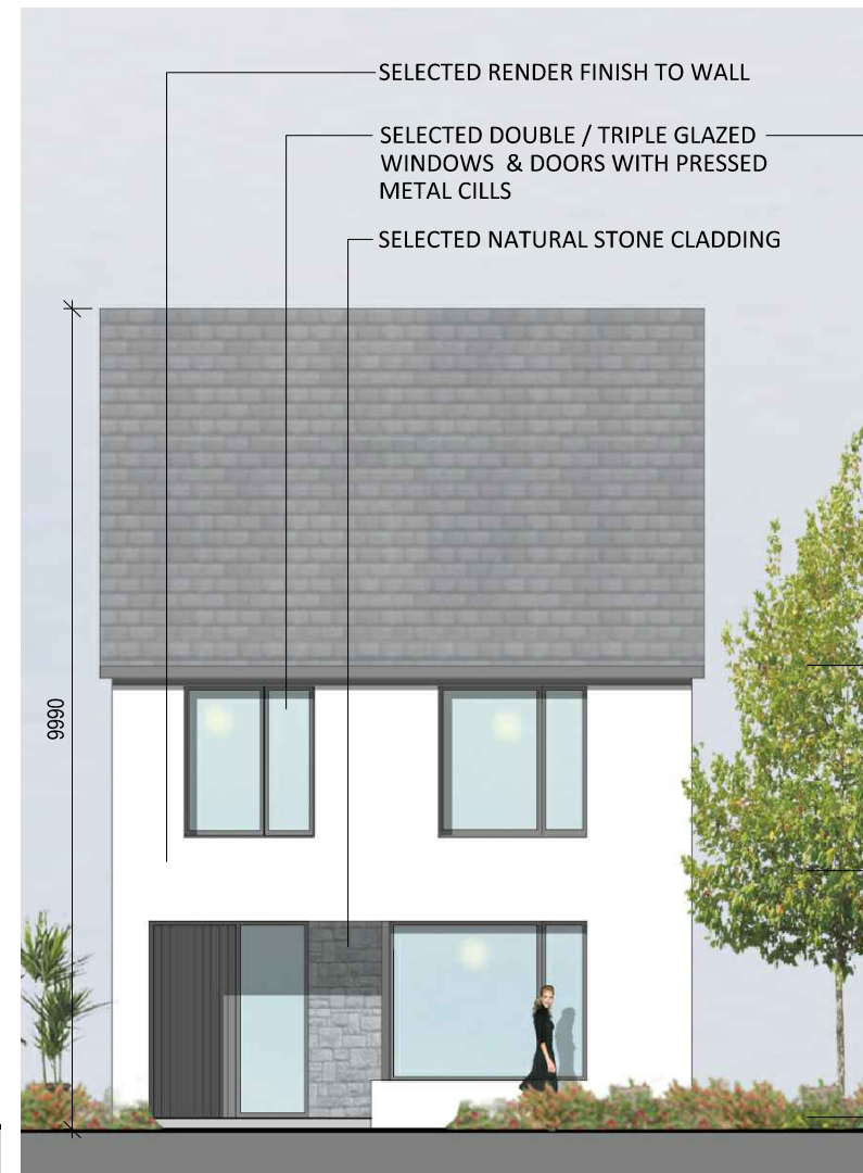
FRONT ELEVATION scale 1:100